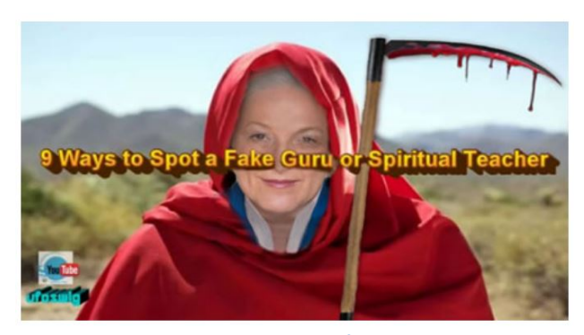
Nine ways to spot a fake guru.

For more information about Patton West and her cult / criminal racketeering gang and her activities in Montana please view the following web pages:-